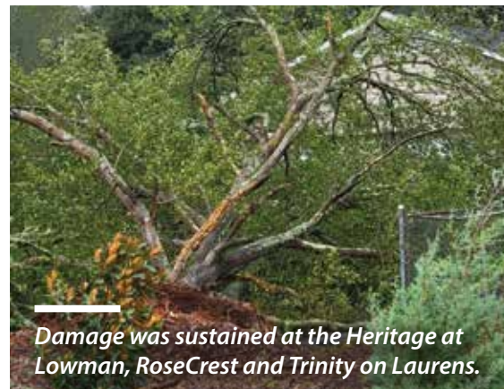
Damage was sustained at the Heritage at Lowman, RoseCrest and Trinity on Laurens.